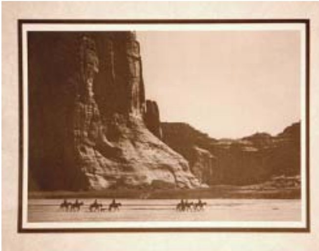
Horseback Riders in Canyon de Chelly, Edward Curtis, circa 1910

Around 1910 Edward Curtis (1868-1952) created a photograph which to this day remains a symbol of the West. Deep into Canyon de Chelly seven travelers ride across the wide expanse of the Chinle Wash while behind them loom the fantastic sandstone formation of Canyon De Chelly. The photograph has a sepia tone, giving it the quality of a historical document while imparting to it a timeless quality. To me this image exists out of time and stands out as a symbol of the West more than a specific moment in time.