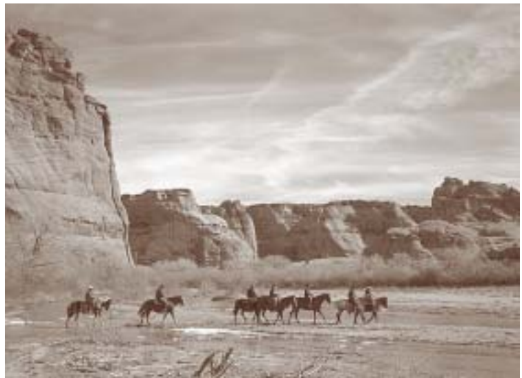
Horseback Riders in Canyon de Chelly #1, Alain Briot, 2002

We all need to reinvent ourselves once in a while and face new challenges. I normally only photograph landscapes and never people in the landscape. However, realizing that I too seek the essence of the West, I set out to create a contemporary version of Curtis' masterpiece. I knew I was about to embark on an uncommon assignment when I realized no photographer wanted to join me for the shoot. Most often back problems were the excuse. It made sense. But there also seemed to be a lack of photographic interest. They just couldn't see what the interest of such a shoot was altogether.