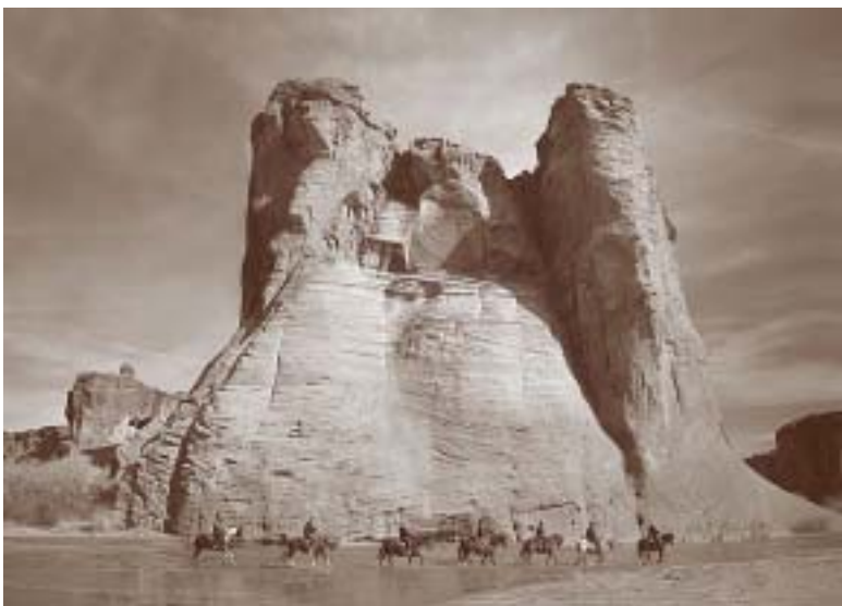
Horseback Riders in Canyon de Chelly #2, Alain Briot, 2002

compose your shot. Almost every time this translates into the necessity of photographing with one hand while attempting, without much luck, to control your mount with the other. In my case I selected a Fuji 645 zi medium format camera since it is both auto-exposure and auto-focus and has a built-in zoom (you might as well forget about changing lenses for the same aforementioned reasons). I also used 220